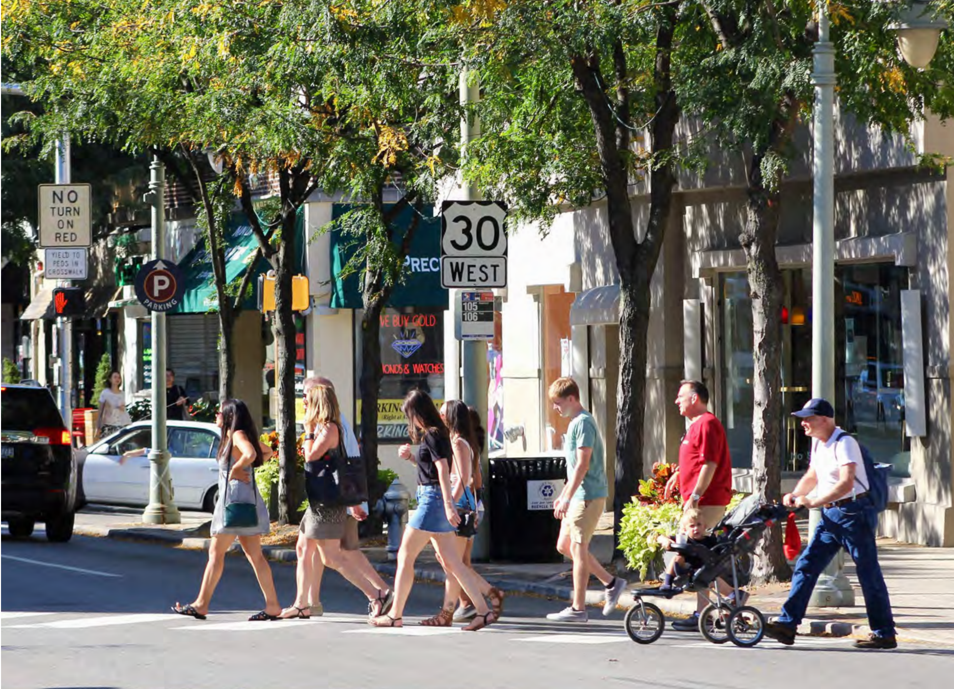
Families visit downtown Ardmore to shop and dine.