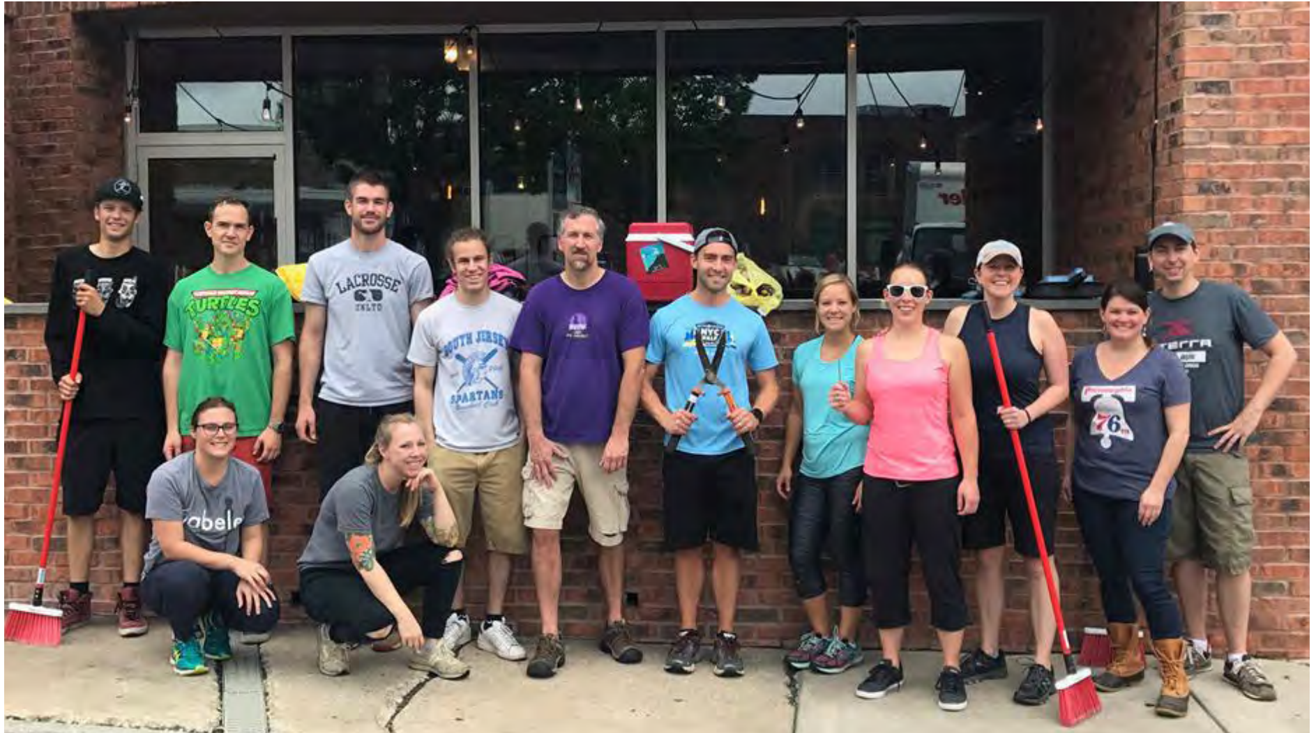
Tired Hands Brewing Co. volunteers clean up Schaufele Plaza.

This 2018-2023 Strategic Plan for downtown Ardmore is a review of the past performance of the organization and a showcase of its hopeful future. This Strategic Plan contains a revised mission statement and a new vision statements. The four Strategies and resulting Strategic Goals mentioned above organize the rest of the document and should be used to guide all the organization's work in the next five (5) years, which is the useful life of this planning document.