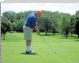
MS Libertyville IL Golf Outing