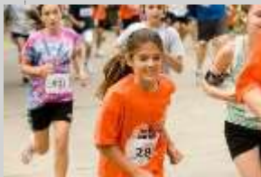
MS Libertyville IL Sunrise Shuffle