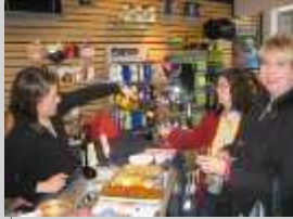
Let's Wine about Winter MS Libertyville IL