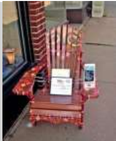
Laconia NH Chair Affair